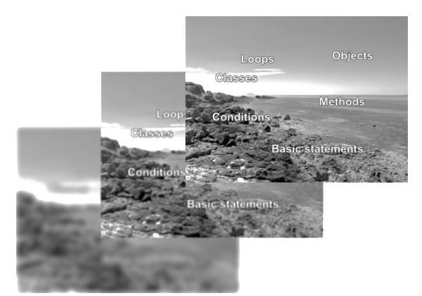
Figure 2: Example of the progressive image model

The burger model is probably much easier to organize as it requires less cross-cutting topics between classes. An integrated view of all topics might be easier to achieve with the progressive image model. Here is not the place to discuss the advantages or disadvantages of both models. In reality, there will be probably anyway a mixture of both approaches. But it has to be clear that whichever you chose will have a major impact on the organization and structure of later classes in your curriculum.